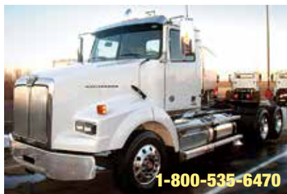
2012 Western Star 4900SA , ISX Cummins Engine 500 hp; 10 mi; Diesel; 13 Spd OD; Engine Brake; Air Ride Suspension; 3.58 Ratio; 22.5 Tires; All Aluminum Wheels; 215 in Wheelbase. New . (CPBW7384-ABQ-3)