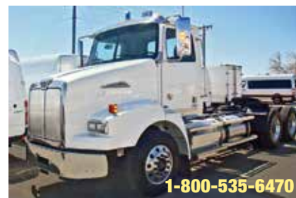
2012 Western Star 4800SB , DD13 Detroit Engine 450 hp; 1,500 mi; Diesel; 13 Spd OD; Engine Brake; Air Ride; 3.58 Ratio; 22.5 Tires; All Aluminum Wheels; 200 in Wheelbase. New . (CPBV6830-ABQ-2)