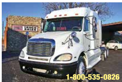
2006 Freightliner Columbia 120 , 70 in Mid Roof Sleeper; MBE4000 Mercedes Engine 450 hp; Diesel; 10 Spd OD; Engine Brake; Air Ride; 3.58 Ratio; 22.5 LP Tires; Alum/Steel Wheels; 239 in WB, Fresh Overhaul , 680,000 Miles. (6LW04248-ABL-3)