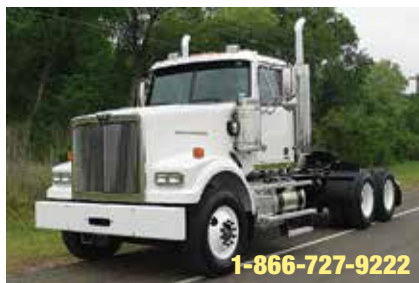
2014 Western Star 4900 , DD15 Detroit Engine 505 hp; Diesel; 10 Spd; Air Ride Suspension; 3.73 Ratio; 24.5 Tires; All Steel Wheels; 215 in Wheelbase; Tandem Axle; 14,700 lb Front Axle Weight; 46,000 lb Rear Axle Weight; 1,500 Miles. (EPFM9894-BRY-2)