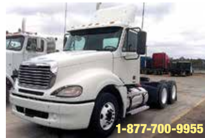
2007 Freightliner Columbia 120 , MBE4000 Mercedes Engine 450 hp; Diesel; 10 Spd OD; Engine Brake; Air Ride; 3.58 Ratio; 22.5 LP Tires; All Steel Wheels; 170 in Wheelbase, 350,038 Miles. (7DY37659-SHV-3)

See a complete inventory of new and used trucks and trailers online at: www.LonestarTruckGroup.com