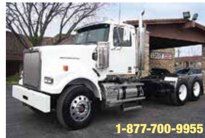
2013 Western Star 4900SF , Detroit DD13, 10 Spd, Air Ride Suspension, 3.90 Ratio, 220" Wheelbase, 24.5 Tires, Aluminum Front Wheels, Steel Rear Wheels. New (DPFA3336-SHV-2)