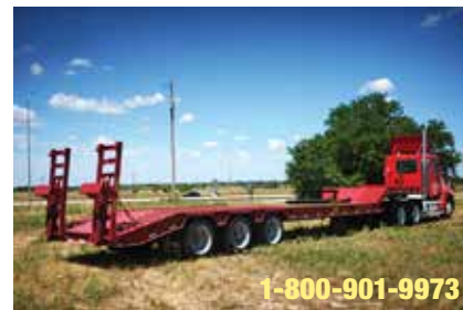
2013 Viking Lowboy , Spring Suspension; 46 ft Length x 102 in Width; Wood Floor; 22.5LP Tires; Steel Composition; Red, Triple Axle Equipment Lowboy. New . (DN062817-SAN-TRL-2)