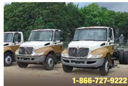
2008 International 4000 Series , International Engine, DT466, Allison Automatic Transmission, Spring Suspension, 22.5 Tires. (2H536158-BRY-3)