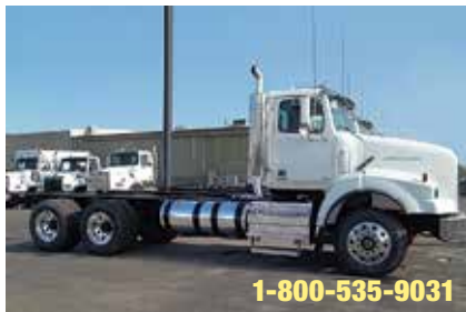
2012 Western Star 4900SA , (Qty: 2) Standard Cab; ISX Cummins 485 hp; Diesel; 18 Spd; Eng. Brake; TufTrac Susp; 4.30 Ratio; 24.5 Tires; Alum. Wheels; 227" WB; 14,600 lb Front Axle; 46,000 lb Rear Axle. New . (DPBW7372-FAR-2)