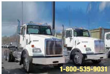
2012 Western Star 4900SB , 18 Spd, Tuff Trac Suspension, 4.30 Ratio, 227" Wheelbase, 24.5 Tires, All Aluminum Tires. New . (CPBW7374-FAR-3)