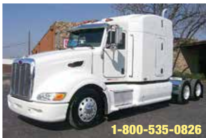
2009 Peterbilt 386 , 63 in Mid Roof Sleeper; C13 Caterpillar Engine 470 hp; Diesel; 13 Spd OD; Engine Brake; Air Ride Suspension; 22.5 LP Tires; Aluminum Outside Wheels, 579,343 Miles. (9D789113-ABL-2)