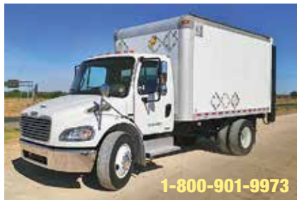
2006 Freightliner M2 106 , Standard Cab; MBE900 Mercedes Engine 210 hp; Diesel Fuel Type; 6 Spd; Spring Suspension; Lift End Gate; Roll up Door; 4.56 Ratio; 22.5 Tires; All Steel Wheels; 178 in Wheelbase, 98,000 Miles. (6HV94008-SAN-3)