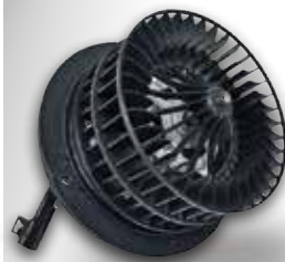
Plate Mount Blower Motor 2-Wire, 12V