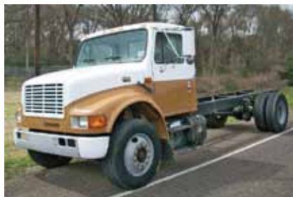
2000 International 4000 Series, International 444 Engine, 210 HP, Allison Transmission, Spring Suspension, 22.5 LP Tires, Steel Wheels, Air Brakes, 199,816 Miles. (YH281083-SAN-2)