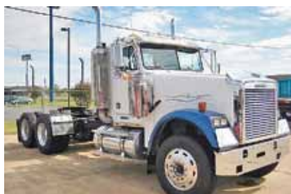
2005 Freightliner FLD12064SD, 14.0L Detroit Engine 515 HP; 10 Spd OD; Diesel; Engine Brake; 4 Bag Air Ride Suspension; 4.33 Ratio; 11R 24.5 Tires; Aluminum/Steel Wheels; 220 in Wheelbase; Tandem Axle, 245,321 Miles. (5DU81605-SHV-2)