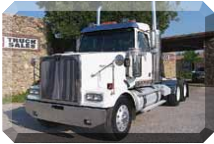
2007 Western Star 4900 , C13 Caterpillar Engine 470 hp; 13 Spd OD; Diesel; Engine Brake; Air Ride Suspension; 3.21 Ratio; 22.5 Tires; Aluminum/Steel Wheels, 404,734 Miles. (7PY757624-ABL-1) $53,500 $51,000