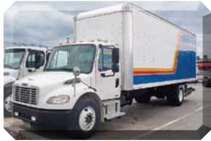
2005 Freightliner M2 106 , C7 Cat 210 hp; Auto-OD; Spring Susp; 26 ft Length; Lift End Gate; Roll up Door; 5.29 Ratio; 22.5 Tires; Steel Wheels; 270" WB; 19,000# Rear Axle; 8,000# Front Axle, 104,011 miles. (5HU28997-ABQ-1) $33,900 $28,900