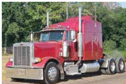
2005 Peterbilt 379, 63" Mid Roof Sleeper; Diesel Caterpillar Engine, 475 hp; Diesel; 13 Spd; Engine Brake; Air Leaf Suspension; All Aluminum Wheels, 628,000 Miles. (5D837526-BRY-2)