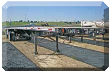
1998 Fontaine Flat Bed , 48' x 96", Airride Suspension - Hardwood Floor, 22.5 LP Tires. (W1579661-SAN-TRL-1A) $8,250