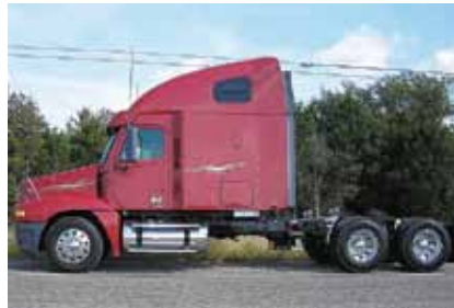
2007 Freightliner CST12064ST Century 120, 70 in Raised Roof Condo; DDE 14.0L Detroit Engine 500 hp; Diesel; 10 Spd OD; Engine Brake; Air Ride; 3.42 Ratio; 22.5 LP Tires; All Aluminum Wheels; 230 in WB; 503,000 Miles. (7PX83749-WAC-3)