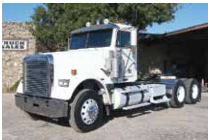
2006 Freightliner FLD12064, MBE4000 Mercedes Engine 450 hp; 10 Spd OD; Engine Brake; Air Ride Suspension; 3.73 Ratio; 22.5 Tires; Aluminum/Steel Wheels; 206 in Wheelbase, 485,734 miles. (6DW47449-ABL-2)