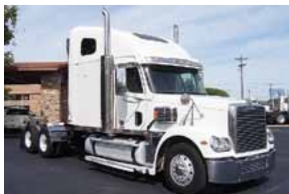
2006 Freightliner CC13264 Coronado, 70" Raised Roof Sleeper; DDC 14.0 Detroit Engine 500 hp; 10 Spd OD; Engine Brake; Air Ride; 3.58 Ratio; 22.5 LP Tires; Aluminum Wheels; 260 in Wheelbase, 721,816 miles. (6PV72525-ABL-3) $37,500