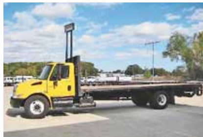
2004 International 4300, Standard Cab; DT466 International Engine 215 hp; 6 Spd; 4 Spring Suspension; 24 ft Length x 102 in Width; 11R 22.5 Tires; All Steel Wheels; 254" Wheelbase; Single Axle; 175,260 Miles. (4H672065-TYL-2)