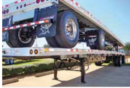
2009 Manac Flat Bed, 48' x 102", Spread Axle, Outside Aluminum Wheels, Cargo Hands, "Chain Ties", Galvanized Steel Cross Members, Zero Down financing with approved Credit. (9K010503-SHV-TRL-4) $24,500 Includes F.E.T.