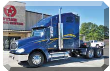
2004 Freightliner CL12064ST Columbia 120 , Detroit Diesel DDC 14.0, 500 HP, 10 Spd, Exhaust Brake, Airride Suspension, 230" Wheelbase, 22.5 LP Tires, all Aluminum Wheels, 840,213 Miles. (4LM99487-TYL-1) $24,500