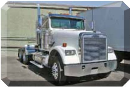
2006 Freightliner Conventional , Mercedes MBE 4000 Engine, 10 Spd., Engine Brake, Airride, 208" WB, 22.5 Tires, All Aluminum Wheels, Air Brakes, Wet Kit, 470,505 Miles. (6DW93202-FAR-1) $38,500