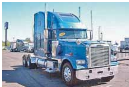
2006 Freightliner FLD13264T - Classic XL, 70 in Double Bunk; C15 Caterpillar Engine 435 hp; 13 Spd OD; Engine Brake; Air Ride Suspension; 3.55 Ratio; 22.5 Tires; All Aluminum Wheels; 260" WB, 423,713 Miles. (6DU26198-ABQ-3) $ 39,900