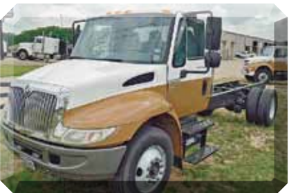
2003 International 4200 , (Qty: 2) DIESEL International Engine 215 HP; Diesel; Automatic; 4 Spring Suspension; All Steel Wheels; 10,000 lb Front Axle Weight; 19,000 lb Rear Axle Weight, 230,000 Miles. (3N574954-WAC-1) $10,500