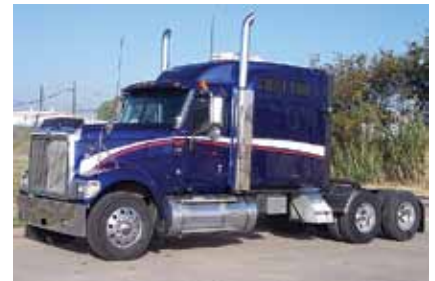
2006 International 9900, Cummins ISX 435, 13 Spd, 260" Wheel Base, Engine Brake, Air Ride Suspension 22.5 Tires, All Aluminum Wheels, Air Brakes, 572,816 Miles. (6C212234-WFF-2)