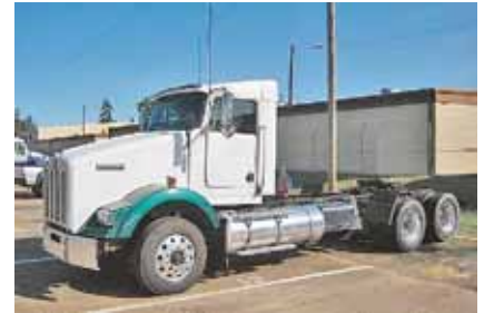
2005 Kenworth T800, C15 Caterpillar Engine 435 hp; 10 Spd OD; Diesel; Engine Brake; Air Ride Suspension; 3.36 Ratio; 22.5LP Tires; All Aluminum Wheels; 228 in Wheelbase; Tandem Axle; 552,754 Miles. (5F096181-TXK-2)