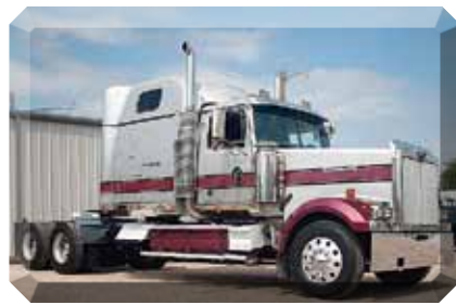
2000 Western Star 4964EX , 70" Hi-Rise Sleeper; 10 Spd OD; Engine Brake; Air Ride Suspension; 24.5 Tires; Aluminum Outside Wheels; 260" WB; Tandem Axle, 1,003,000 Miles. (YK960301-SAN-1) $16,950