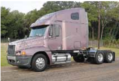
2007 Freightliner CST12064ST Century, 70" Hi-Style Sleeper; DIESEL Detroit Engine 500 hp; Diesel; 10 Spd; Engine Brake; Air Ride Suspension; All Aluminum Wheels, 558,000 (7LX66131-WAC-2) $42,500