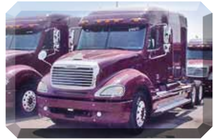
2006 Freightliner Columbia 120 , Detroit Diesel DDC 14.0, 455 HP, 10 Spd., Exhaust Brake, Air Ride Suspension, 240" Wheelbase, 22.5 LP Tires, All Aluminum Wheels, 540,213 Miles. (6LV49831-SHV-1) $31,500