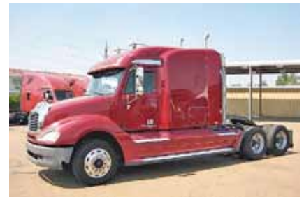
2005 Freightliner CL12064ST Columbia 120, 70 in Mid Roof XT Sleeper; 14.0L Detroit Engine 515 hp; 10 Spd OD; Engine Brake; 4 Bag Air Ride Suspension; 3.73 Ratio; 24.5 Tires; Aluminum Outers; 237" WB; 711,212 Miles. (5LU01696-TYL-3)