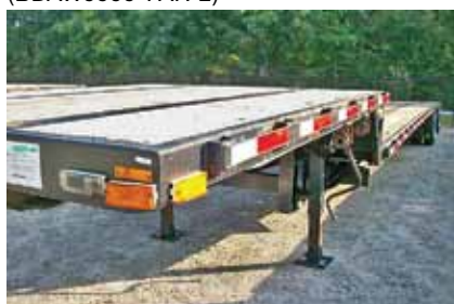
2006 Transcraft Drop Deck, 53" x 102", Airride Suspension, 11R22.5 Tires, Tool Box, Winches. (61080548-SAN-TRL-3)