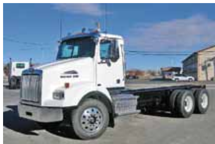
2011 Western Star 4900SA , Detroit Diesel DD13, 450 HP, Tuff Trac Suspension, 220" Wheelbase, 24.5 Tires, Aluminum Front Wheels, Steel Rear Wheels, Zero Miles. (BPAZ8428-FAR-3)