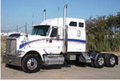
2007 International 9900, Cummins ISX, 435 HP, 13 Spd, Engine Brake, Airride Suspension, 260" Wheel Base, 22.5 Tires, All Aluminum Wheels, Air Brakes, 599,330 Miles. (7C398278-WFF-3)