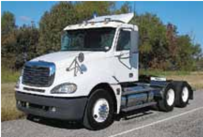
2005 Freightliner CL11264ST Columbia 112, 14 Detroit Engine 430 HP; 10 Spd OD; Diesel; Engine Brake; Air Ride Suspension; 3:70 Ratio; 22.5 Tires; All Steel Wheels; 171 in Wheelbase; Tandem Axle; 364,000 Miles. (LU11416-TEM-2)