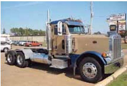
2006 Peterbilt 379EXHD, C15 Caterpillar 550 hp; 10 Spd OD; Eng-Brake; Chalmers Susp; 3.91 Ratio; 11R 24.5 Tires; Alum/Steel Wheels; 230 in Wheelbase; 12,000 lb Front Axle Wt; 46,000 lb Rear Axle Wt, 342,123 Miles. (6D899528-TXK-3)