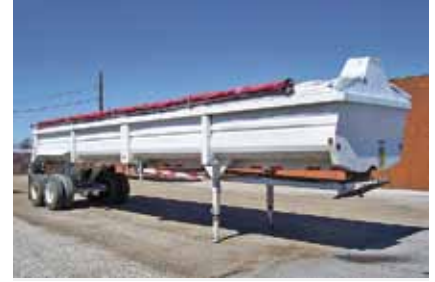
1995 Lufkin End Dump, 38' x 96", Tarp Installed. Ready to Work Today. (S1120365-TEM-TRL-4) $10,650