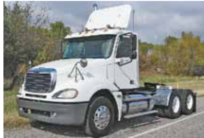
2006 Freightliner CL12064S Columbia 120, Detroit Engine 430 HP; 10 Spd OD; Diesel; Engine Brake; Air Ride Suspension; 22.5 Tires; All Steel Wheels, 313,000 Miles. (6LW72163-TEM-3)