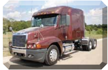
2007 Freightliner Century C12064ST , 70 in Mid Roof XT Sleeper; 14.0 Detroit Engine 500 hp; 10 Spd OD; Engine Brake; Air Ride Suspension; 3.42 Ratio; 22.5 Tires; All Aluminum Wheels; 230" WB; 463,150 Miles. (7LV75234-BRY-1) $46,500