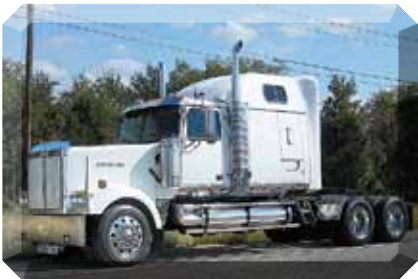
1999 Western Star 4900EX , 3406 Caterpillar Engine 550 hp; 13 Spd OD; Engine Brake; Air Ride Suspension; 24.5 Tires; All Aluminum Wheels; 260" Wheelbase; Tandem Axle. (XK959182-TEM-1) $18,500