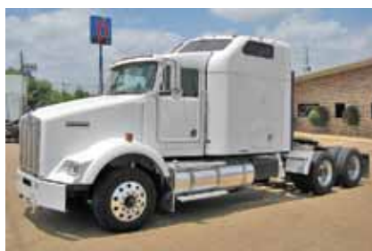
2005 Kenworth T800, Caterpillar C15, 435 HP, 10 Spd., Exhaust Brake, Air Ride Suspension, 228" Wheelbase, 22.5 LP Tires, All Aluminum Wheels, 654,023 Miles. (5F096173-SHV-3)

See a complete inventory of new and used trucks and trailers online at: www.LonestarTruckGroup.com