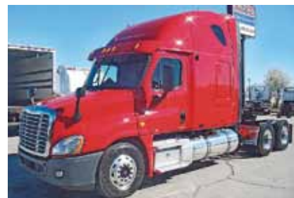
2011 Freightliner CA12564SLP Cascadia, 72" Double Deck Condo; DD15 Detroit 505 HP; 1,295 mi; 10 Spd OD; Eng-Brake; Airride; 3.42 R; 22.5 Tires; Alum. Wheels; 240" WB; 13,300# Front; 40,000# Rear, Zero Miles (BSAZ8623-ABQ-2)