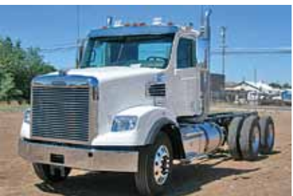
2011 Freightliner Coronado , Detroit Diesel DD15, 475 HP, 10 SPD, Engine Brake, Tuff Trac Suspension, 227 Wheelbase, Air Brakes, Tire Size 24.5, Dual Locking Differentials, Aluminum Outers, Zero Miles. (BDAW9999-FAR-2)