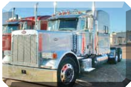
2005 Peterbilt 379 . Caterpillar C15, 475 HP, 18 Spd., Exhaust Brake, Air Ride Suspension, 270" Wheelbase, 24.5 LP Tires, All Aluminum Wheels, 853,210 Miles. (5N853206-TXK-1) $42,500