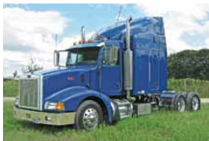
2006 Peterbilt 385, Caterpillar C15, 475 HP, 10 Spd, Engine Brake, Air Ride Suspension, 225 Wheel Base, 22.5 LP Tires, Aluminum Front Wheels, Steel Rear Wheels, 513,343 Miles. (6N855618-BRY-3)